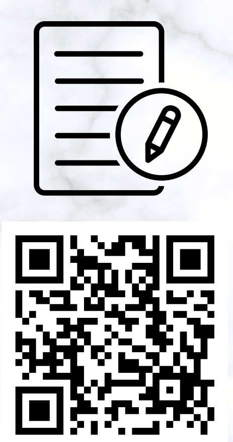
Scan QR Code to register